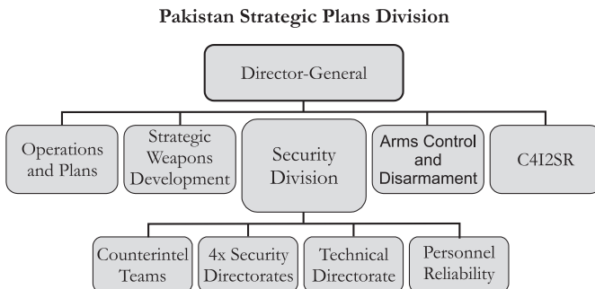
Figure 3: Pakistan Strategic Plans Division 47