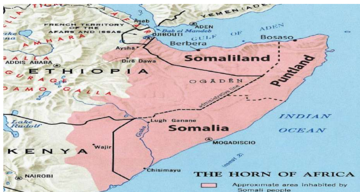
Map 1. Territories claimed by AIAI