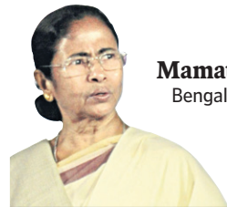
Mamata Banerjee Bengal Chief Minister

How dare they (BJP) criticise me of being partial to a certain section of people — it is absolutely baseless. I work for all sections of the people belonging to different religions and communities