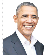
Barack Obama Former US President

India should cherish and nurture its large Muslim population that thinks of itself as Indian... If communities across India are saying they won't fall prey to division, then it will strengthen the hand of politicians who feel that way