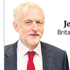
Jeremy Corbyn Britain's Labour leader

Bankers like Morgan Stanley should not run our country but they think they do. So when they say we're a threat, they're right: We're a threat to a damaging and failed system that is rigged for the few.