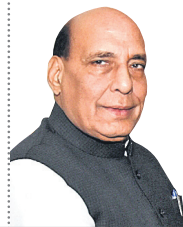
Rajnath Singh Home Minister

Every scheme introduced by Narendra Modi is so successful that Rahul Gandhi is very 'pareshaan'. He is so troubled that he is queuing up at temples. Have you seen him going to temples before?